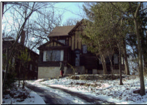
10856 Longwood Drive; front of house faces east.

runs along the north side of the lot to the front of the house turning south and then runs along the south side of the house to the rear. The drive is lined on both sides with large trees some two feet in diameter. Several trees are located very close to the drive and would cause an access problem with increased traffic. The yard and grounds have been maintained in keeping with the area. A single car garage is located some 60 feet to the northwest of the house and some 40 feet from the rear west lot line. The style of the house is English Tudor with wood siding on the lower half and stucco on the upper half. The house is approximately 2400 square feet not includ-