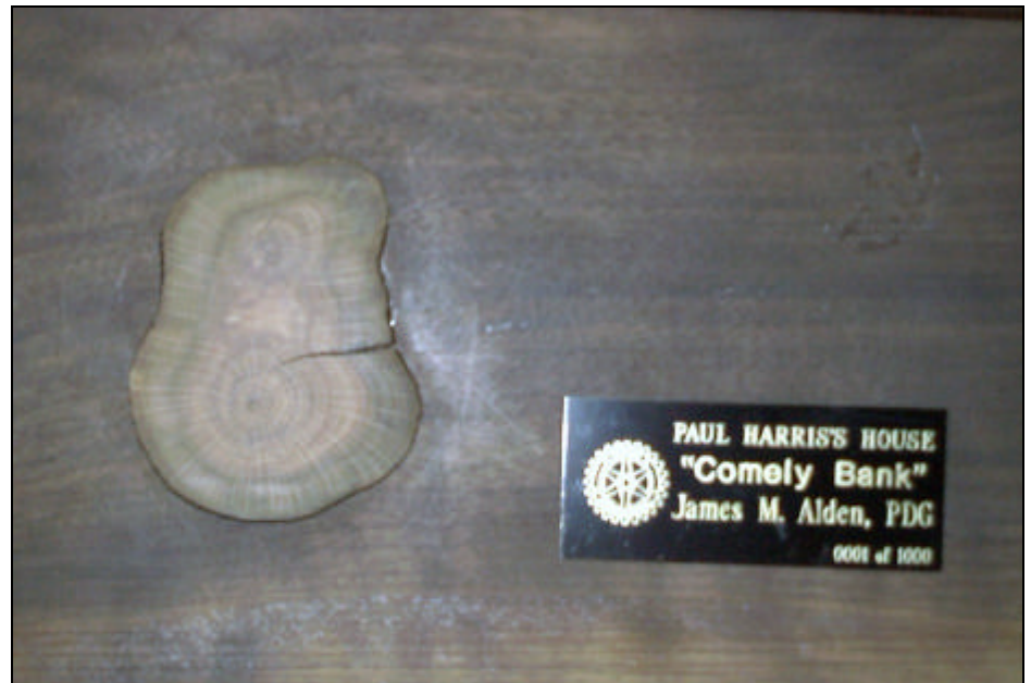
Those who donate $1,000 or more receive a plaque containing a cross-section of a limb from a tree at the Rotary Presidential Memorial Walkway at Mount Hope Cemetery

runs along the north side of the lot to the front of the house turning south and then runs along the south side of the house to the rear. The drive is lined on both sides with large trees some two feet in diameter. Several trees are located very close to the drive and would cause an access problem with increased traffic. The yard and grounds have been maintained in keeping with the area. A single car garage is located some 60 feet to the northwest of the house and some 40 feet from the rear west lot line. The style of the house is English Tudor with wood siding on the lower half and stucco on the upper half. The house is approximately 2400 square feet not includ-